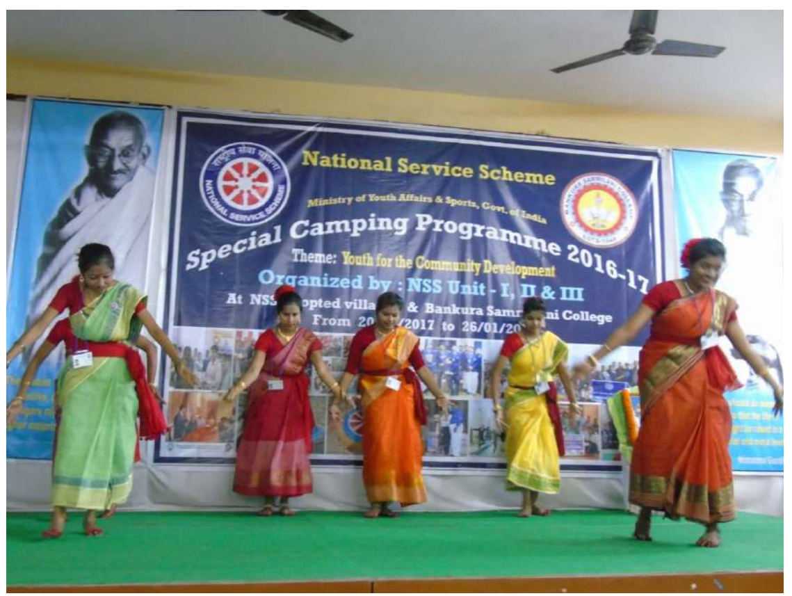
Cultural programme during the inaugural session of the Special Camping Programme.

Action photographs of Special Camping Programme from 20 to 26.01.2017at NSS Adopted village and College Campus as well are as follows: